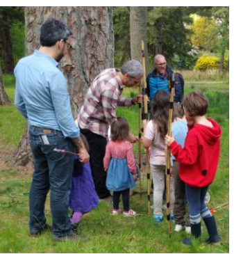
Trying out home made bows and arrows.