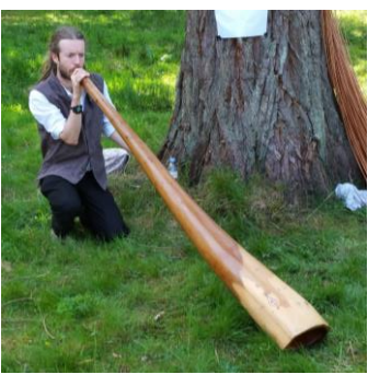
That's a very big didgeridoo!