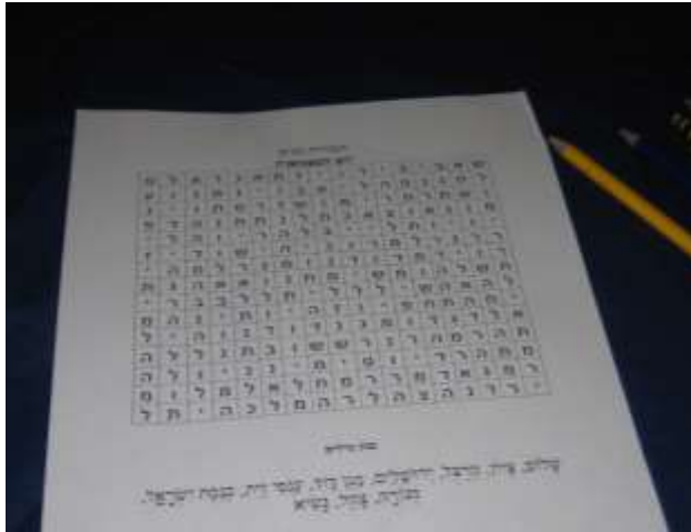
A Hebrew word search