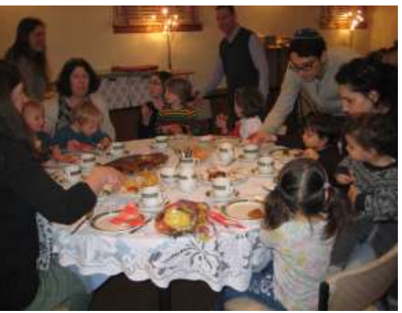
Parents and children's tea table