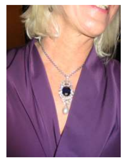
The Lady Provost wears the Rosebery Jewels