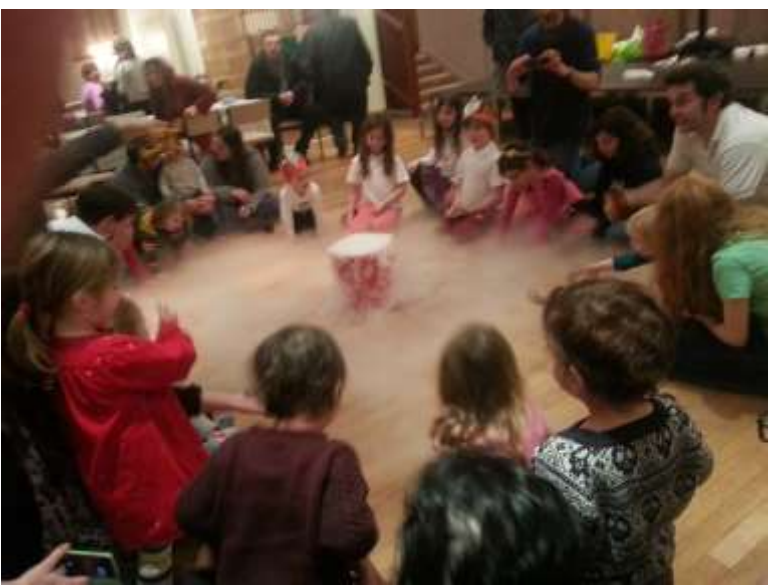
The magic of Think Science