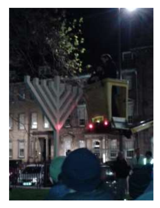
The Chanukiah in St Andrews Square

There is so much to report about Chanukah. On Sunday 6 December, the night of the first candle, Chabad Edinburgh held their annual public Chanukiah candle lighting in St Andrews Square, followed by a reception courtesy of Harvey Nichols.