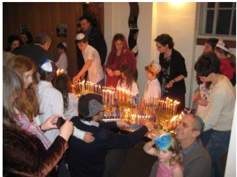
Mass Chanukiah lighting at EHC