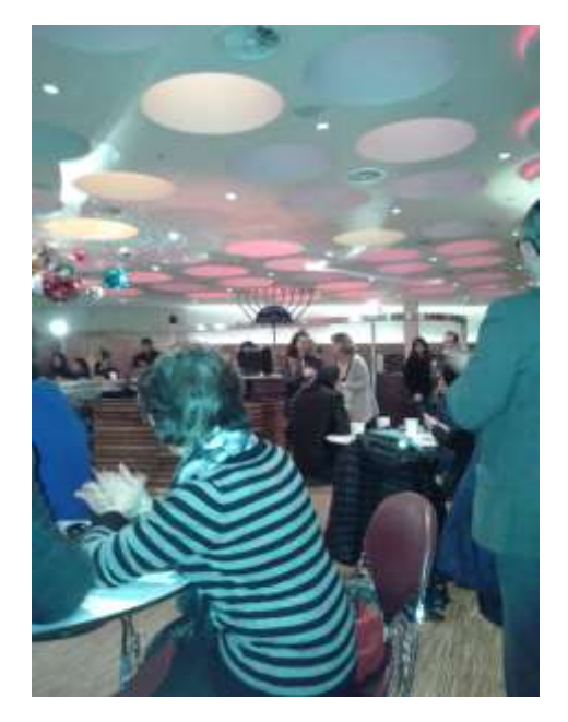
Inside Harvey Nichols

On Monday 7 December, the Lord Provost hosted a reception at the City Chambers for the second candle.